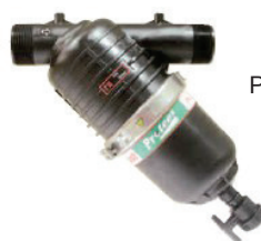
Proteas - 3399-3