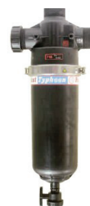
Typhoon - 3396-2